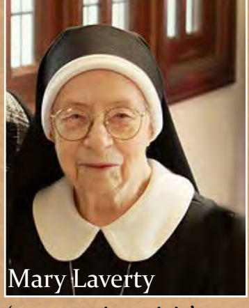
'present in spirit'